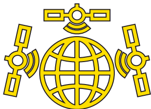
Multi Constellation GNSS for precision global coverage

Whatever your work, sport or hobby; carry a SafeLink SOLO PLB, your personal emergency location beacon. The SafeLink SOLO PLB, through the 406 MHz international search and rescue satellite system, enables you to get in touch with the emergency rescue services anytime and anywhere in the world. Once activated the SafeLink SOLO PLB will transmit constantly for a minimum of 24 hours, and will operate at temperatures down to -20^{\circ}\text{C} . It also has an SOS LED flashing light that the user can switch on to aid rescue in the dark.