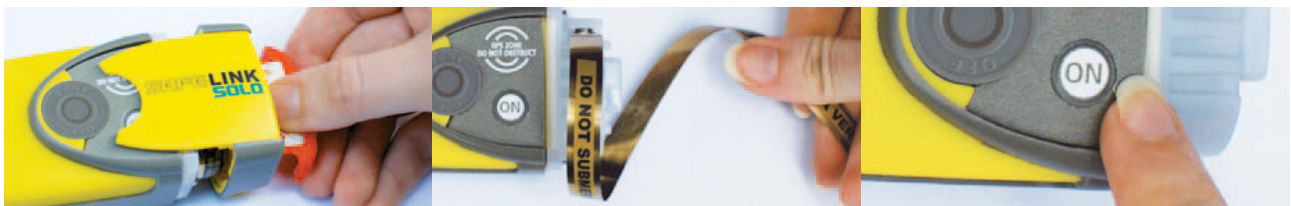
1 Tear off red anti-tamper lid.