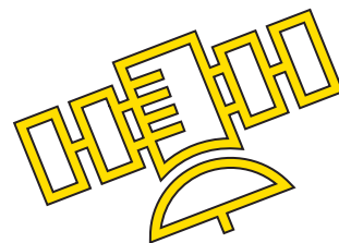
MEOSAR Compatible will work with the new MEOSAR Network