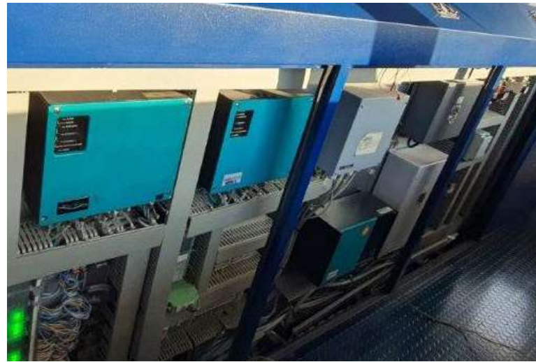
Pre installation VDR layout