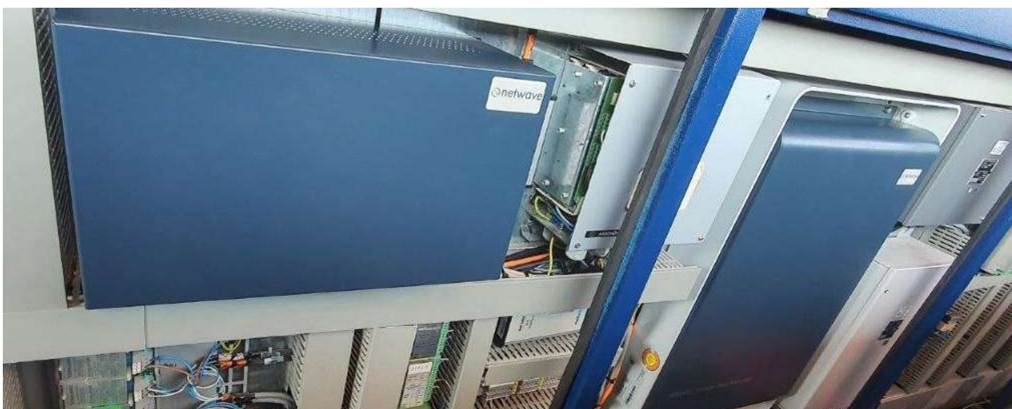
Installed NW6000 occupying previous VDR console